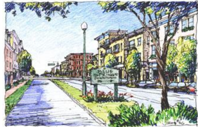
The Current Mixed Use Street