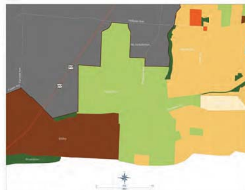
SOUTH PATTERSON AVE