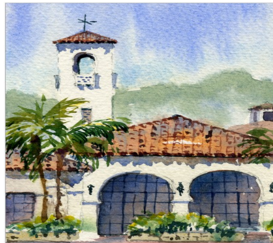
Architect: A.B. Harmer, 1931

The purpose of this update is to ensure that the size, bulk, and scale of detached accessory structures are compatible with surrounding development.